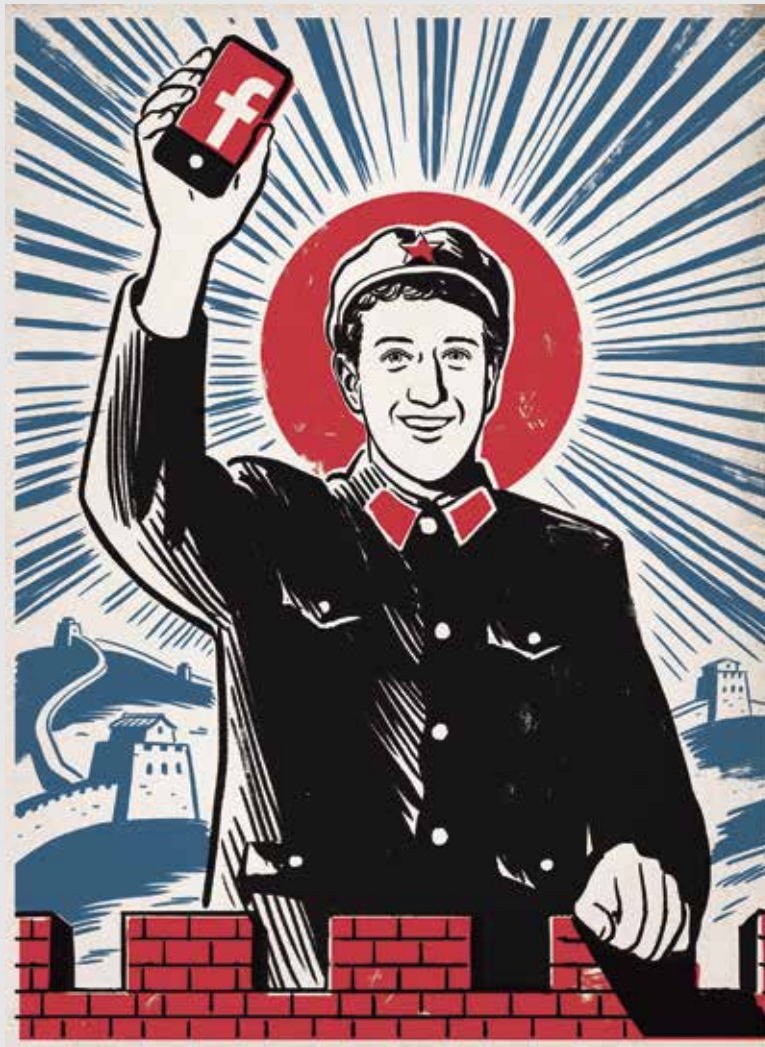
← When Facebook enters China.

6 - VIETNAM: The cyber-security law that Vietnam adopted in June 2018, which significantly reinforces the regime's grip on the Internet, is a close replica of the one that China adopted just one year earlier.