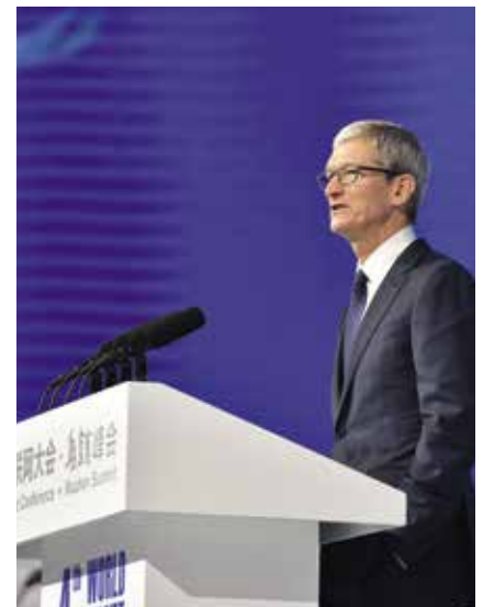
↑ Apple CEO Tim Cook at the 4th World Internet Conference in Wuzhen.

Traditionally, China also had no more than a very limited role in international media meetings. This has been the case, for example, with the Web Summit, an annual event organised by an Irish company that describes itself as the world's biggest gathering of journalists, with more than 2,500 participants from such media outlets as Bloomberg, the Financial Times , Forbes , CNN , CNBC and the Wall Street Journal . It emphasizes professionalism and editorial freedom – values diametrically opposed to those of the Chinese Communist Party. Similarly, the annual World News Media Congress, held for the 70 th time in Portugal in June 2018, awards a press freedom prize called the Golden Pen of Freedom – a feature that clearly does not appeal to Beijing's leaders.