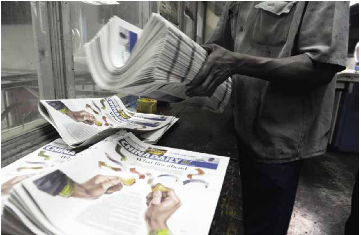
↑ The English-language China Daily newspaper, which has special issues for the Americas, Africa, Europe and Asia, boasts a daily circulation of 900,000 copies and a combined readership of 150 million people.

At first glance, CGTN seems less one-sided in its international coverage, often quoting Western news sources such as AFP or Voice of America (VOA). But its approach consists above all in the presentation of hard, positive facts excluding critical comments and perspective, especially if the subject involves China. When CGTN Africa announces a new industrial, mining or infrastructural project, there is no mention of the views of the local population or the dangers of pollution, corruption or human rights violations that might emerge from the project.